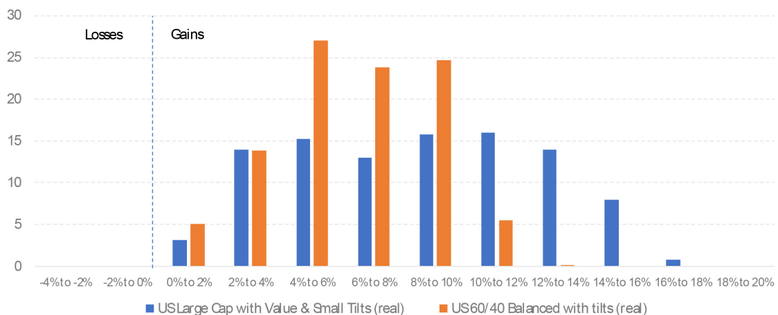
Figure 5: Distribution of 15-year annualised real returns

Yes we are - it looks like 'long term' is around 10-15 years. The distribution of 15-year real return outcomes for 100% US equities (with tilts to value and small caps) and a 60/40 balanced portfolio, provides additional insight. It is evident that above 15 years the chances of a negative purchasing power outcome is negligible, but as the quote from Eugene Fama at the top of this article states, it still exists!